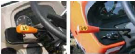
Hydraulic Shuttle Synchro-Shuttle

Simply lock the brake pedals together, press down, and pull up on the parking brake lever will securely lock the wet disk brakes in place.